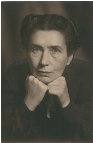
Lotte Meitner-Graf, Portrait of Lucia Moholy, c.1953–1955 Bauhaus-Archiv Berlin

Please note that the photographs are subject to copyright and that they are provided for use exclusively in the context of current-affairs reporting on the special exhibition.