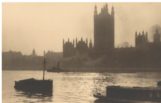
Lucia Moholy, "The Houses of Parliament" (picture postcard), c.1936