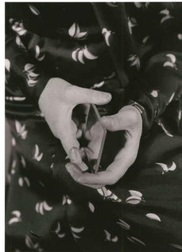
Lucia Moholy, Hands with pocket mirror, 1936 Bauhaus-Archiv Berlin © VG Bild-Kunst Bonn