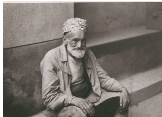
Lucia Moholy, Old man, Sarajevo, Yugoslavia, c.1930–1932 Bauhaus-Archiv Berlin © VG Bild-Kunst Bonn