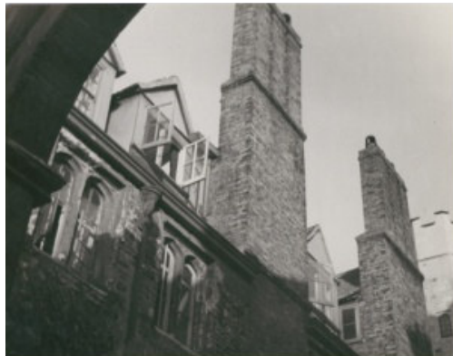
Lucia Moholy, Untitled (London, chimneys) c.1936