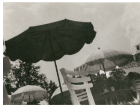
Lucia Moholy, Untitled (parasol at a countryside pub near London), 1936