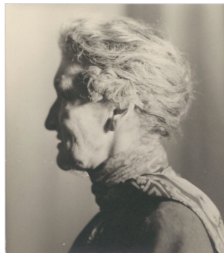
Lucia Moholy, Portrait of Emma Countess of Oxford and Asquith, 1935