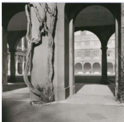
Lucia Moholy, Cambridge, 1936