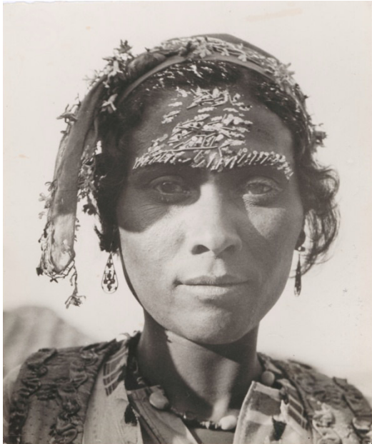
Lucia Moholy, "Gypsy from Skopje", Yugoslavia, adorned for a wedding, c.1930–1932