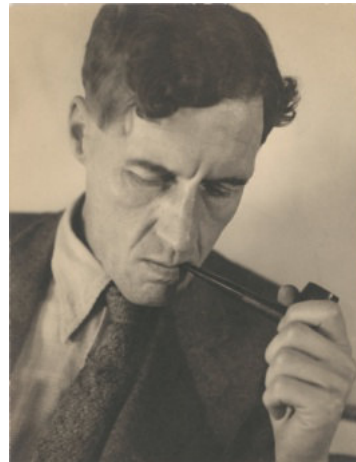
Lucia Moholy, Portrait of Patrick Maynard Stuart Blackett (1st Baron Blackett), 1936