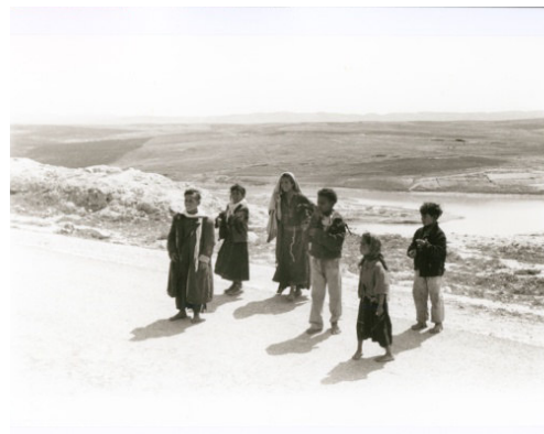
Lucia Moholy, Israel, 1956 Bauhaus-Archiv Berlin © VG Bild-Kunst Bonn