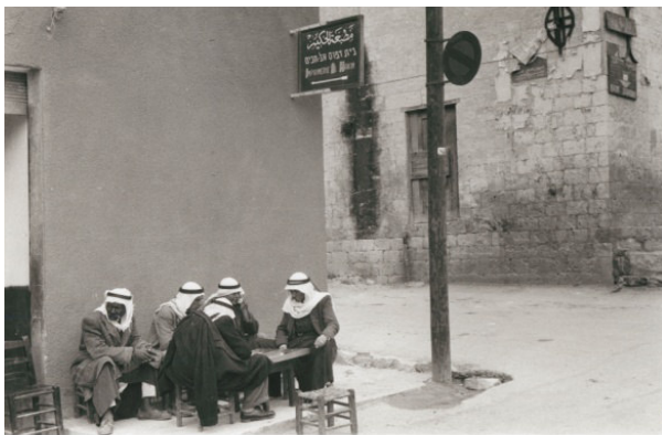
Lucia Moholy, Nazareth, 1956