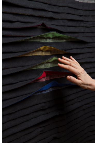
Manuela Leite, woven fabric with folds and motion sensors that make the folds open to reveal colourful fabric, 100% cotton © design: Manuela Leite