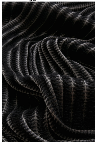
Josefine Düring, Farce double , 50% wool, 50% polyurethane, large waffle weave, dobby loom © design/photo: Josefina Düring