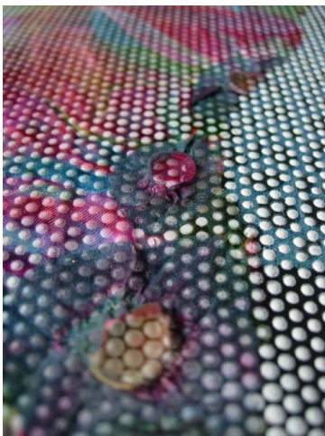
Uta Tischendorf, Colourful Creatures , 50% cotton, 50% polyester, woven und organza with adhesive, combination of shibori, transfer and screen print