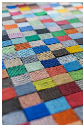
LCS Perlon rep in the colours of LeCorbursier, free selected colour and quality variants, 100% polyamide