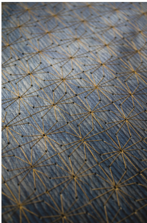
Josefine Düring, Pinifere Profonde , finished veneer, 100% spruce, screen print with reactive dye, perforated, embroidered