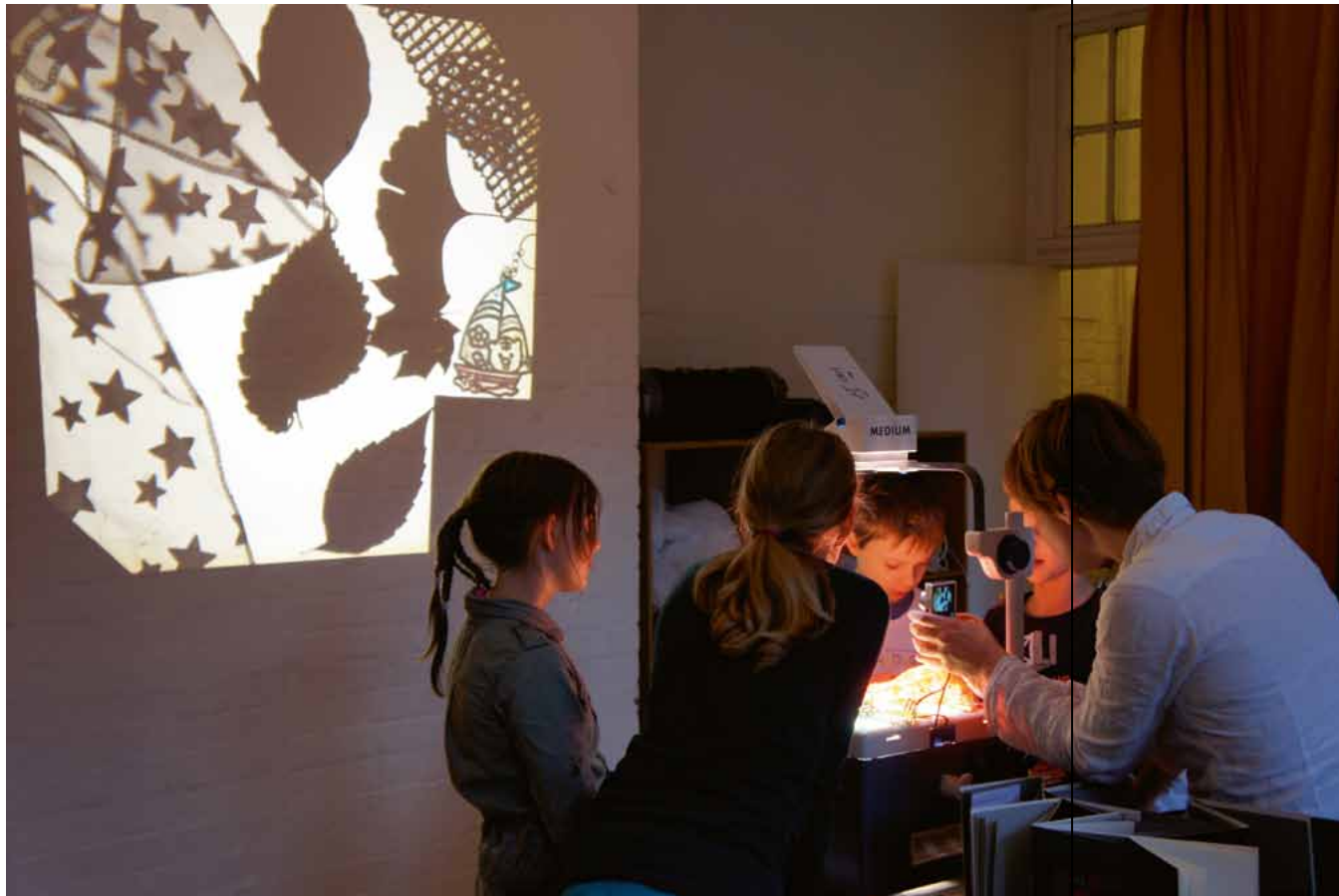
World of light and shadow: getting ready to work with photograms in the lab, 2014 autumn holiday programme

The objects in the collection of the Bauhaus-Archiv / Museum für Gestaltung offer abundant possibilities for establishing links to the everyday world of children and teenagers. The museum is thus the ideal place to present Berlin architecture and design in a practically oriented manner. The museum education programme encompasses open activities for children, teenagers and families as well as tours and workshops for groups.