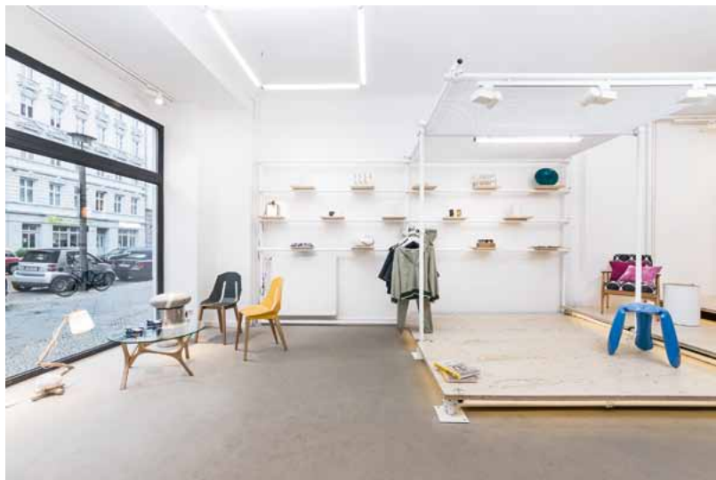
Product design in Berlin-Prenzlauer Berg

bauhaus_excursions Excursions in cooperation with art:berlin to modernist sites in and around Berlin. Booking required, early reservation is recommended! Group bookings possible, also in other languages. Tel. 030/28096390, info@artberlin-online.de, www.artberlin-online.de