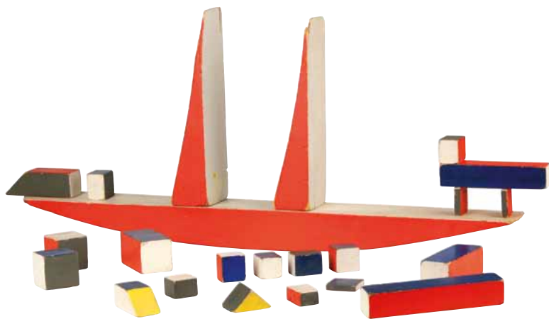
Alma Siedhoff-Buscher, Large Ship Building Blocks , 1923