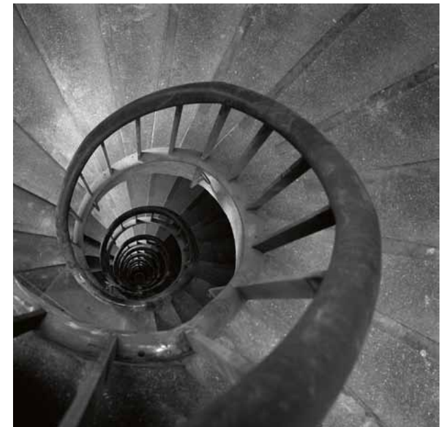
John Hejduk, Housing, Berlin, 1988