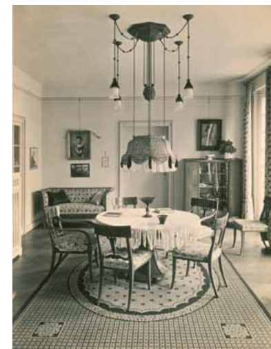
Ludwig Mies van der Rohe (design), Carl Rogge (photograph), Haus Werner, View of the Dining Room, 1914

A largely unknown aspect of the work of the Bauhaus's last director, Ludwig Mies van der Rohe, will be the focus of this exhibition dealing with an early work of the internationally known architect: the Werner House, built in Berlin in 1914. The Bauhaus-Archiv holds numerous documents, photographs and, above all, pieces from its original furnishings.