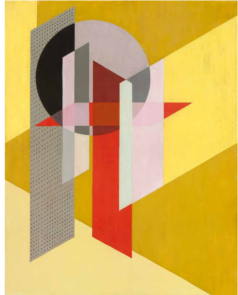
László Moholy-Nagy, Construction Z VII , 1926, National Gallery Washington

Monday - Thursday 2.2. - 5.2. 10 am - 2 pm bauhaus_vacation_programme »Fantastic buildings: design and build architectural models of the future«, ages 8 and up Booking: Tel. 030/2664222-42, info@jugend-im-museum.de