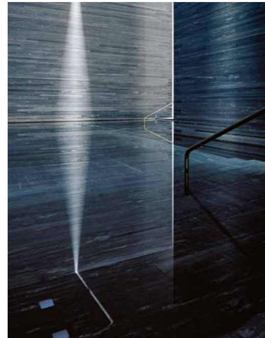
Peter Zumthor, Therme Vals, Switzerland, 2006

Sunday 21.6. 3 pm bauhaus_barrier_free Tours for blind and visually impaired visitors Booking: visit@bauhaus.de