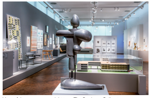
View of the permanent exhibition, »The Bauhaus Collection«