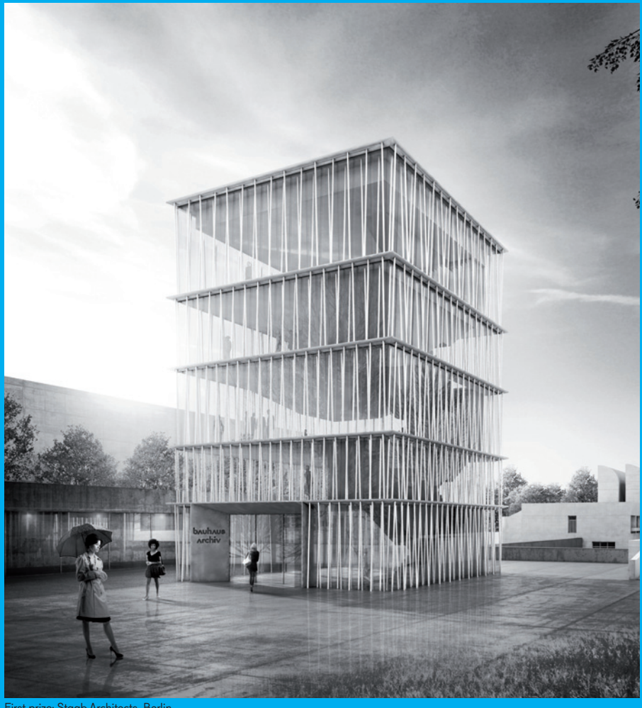
First prize: Staab Architects, Berlin