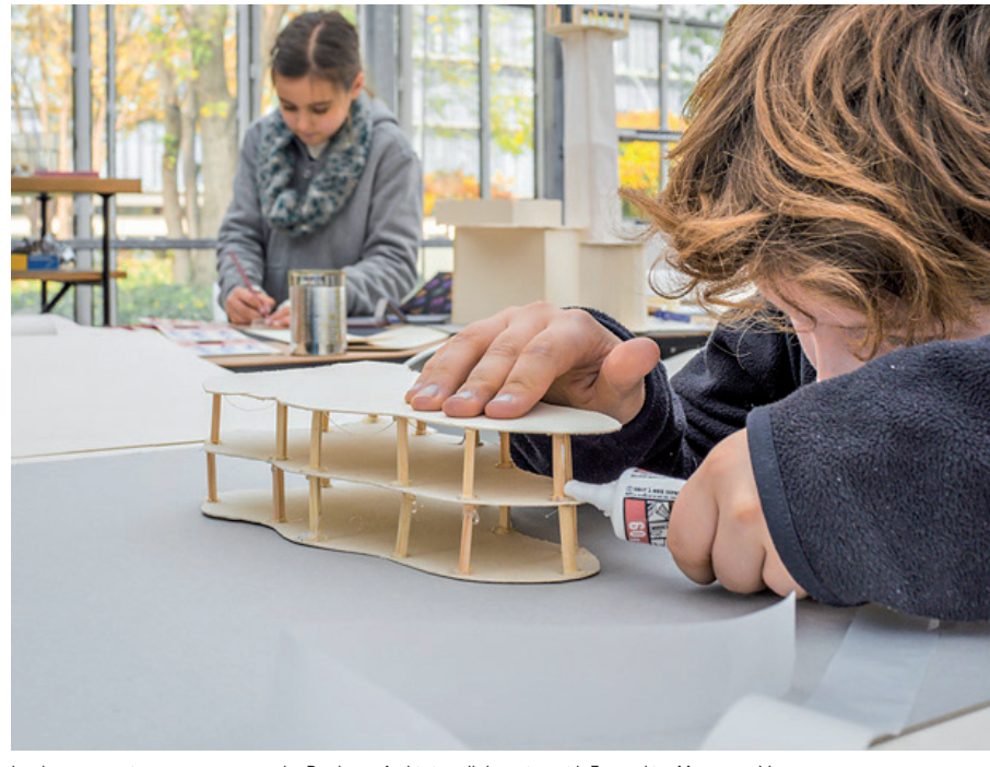
bauhaus_vacation_programme at the Bauhaus-Archiv in collaboration with Jugend im Museum e.V., 2015