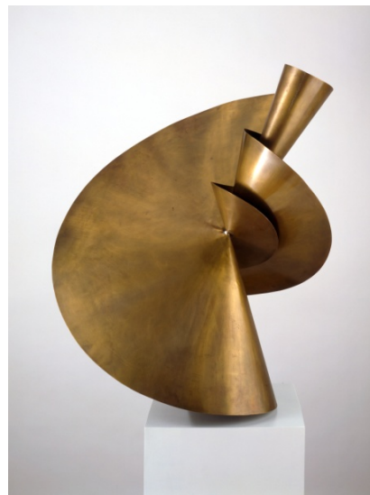
Takehiko Mizutani, Three-part sculpture (material study from Albers's preliminary course), 1927