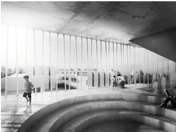
View from the glass tower towards the existing building © Staab Architekten, Berlin