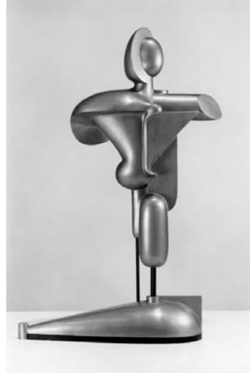
Oskar Schlemmer, Free Sculpture G, design 1921–1923, cast 1963 Bauhaus-Archiv Berlin, photo: Gunter Lepkowski