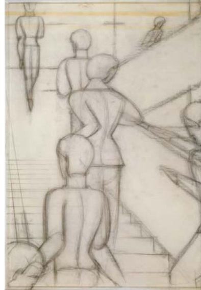
Oskar Schlemmer, Bauhaus stairway (1:1 scale working drawing for the painting of the same name at the Museum of Modern Art in New York), 1932