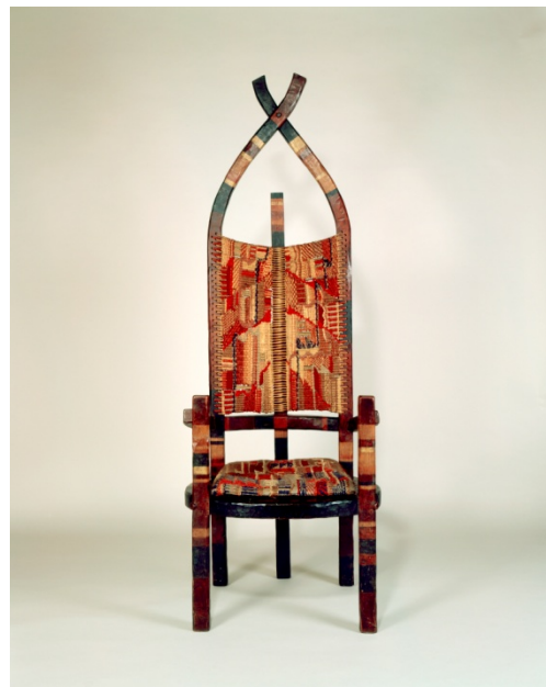
Marcel Breuer (frame design), Gunta Stözl (textile design), African Chair, 1921