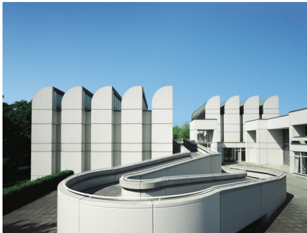
Das Bauhaus-Archiv / Museum für Gestaltung, Berlin Architects: Walter Gropius, Alex Cvijanovic and Hans Bandel

Please note that the photographs are subject to copyright and that they are provided for use exclusively in the context of current-affairs reporting on the Bauhaus-Archiv / Museum für Gestaltung and its Bauhaus exhibition. The photo material can be downloaded at: http://www.bauhaus.de/en/presse/aktuell/