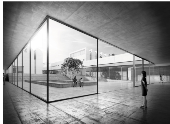
View from the foyer of the lowered inner courtyard