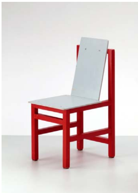
Marcel Breuer, Children's Chair, design 1924 Bauhaus-Archiv Berlin