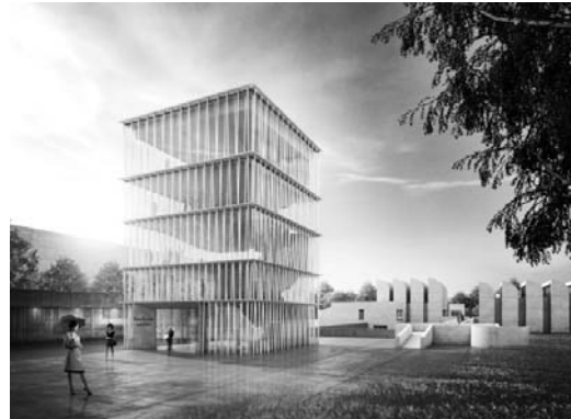
Glass tower as events venue and entrance to the museum below it © Staab Architekten, Berlin