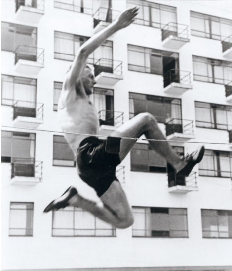
Hajo Rose, "High jumper in front of the Prellerhaus", 1930