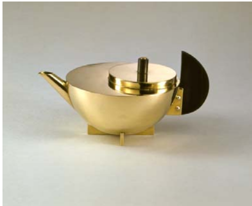
Marianne Brandt, Tea Infuser (MT 49), 1924 Bauhaus-Archiv Berlin