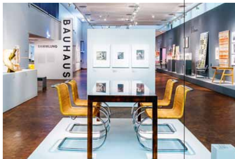
View of the new presentation of The Bauhaus Collection