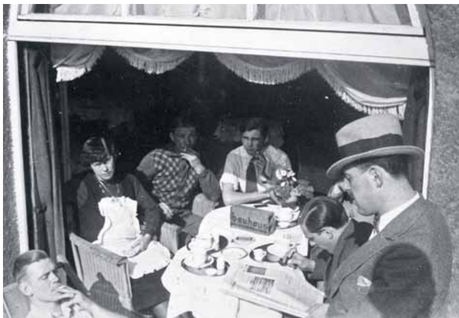
Bauhaus students at a cafe, c.1932