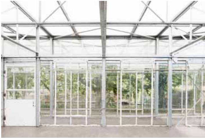
The temporary pavilion bauhaus re use, architecture: zukunftsgeraeusche GbR

It is also possible to rent bauhaus re use: please direct inquiries to vermietung@bauhaus.de .