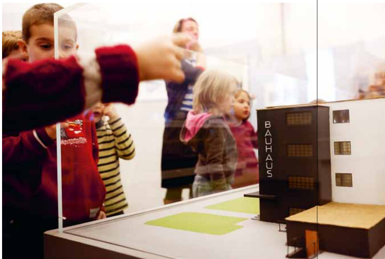
Children viewing the model of the Dessau Bauhaus Building at the Bauhaus-Archiv

The Bauhaus (1919–1933) was the 20th century's most important school for design. At the Bauhaus-Archiv / Museum für Gestaltung the objects of the world's largest Bauhaus collection offer abundant possibilities for establishing links to the everyday world of children and teenagers. The activities offered by our bauhaus_workshop accordingly provide a hands-on approach to Bauhaus topics and content.