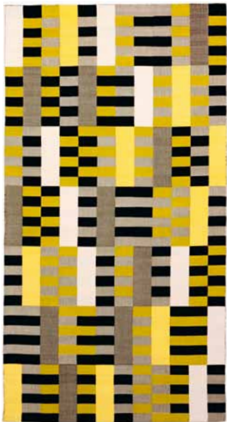
Anni Albers, Tapestry, design 1926, manufactured by Werkstatt Gunta Stölzl 1964