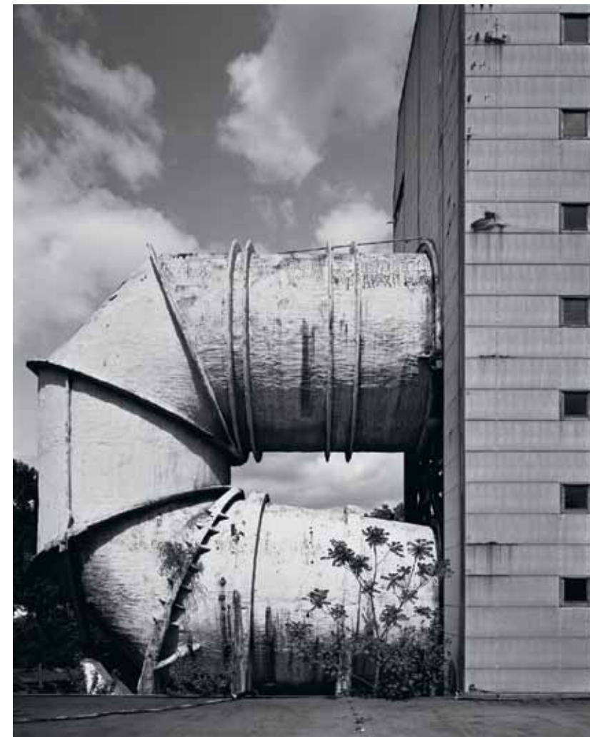
Hélène Binet: Ludwig Leo, Circulation Tank of the Hydraulics Laboratory, Berlin, 2014

bauhaus_brunch Brunch, admission and tour: € 20, members € 16 Booking: visit@bauhaus.de